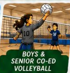
BOYS & SENIOR CO-ED VOLLEYBALL